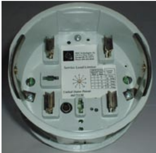
United States Patent # 6373150 Canadian Patent # 2340492